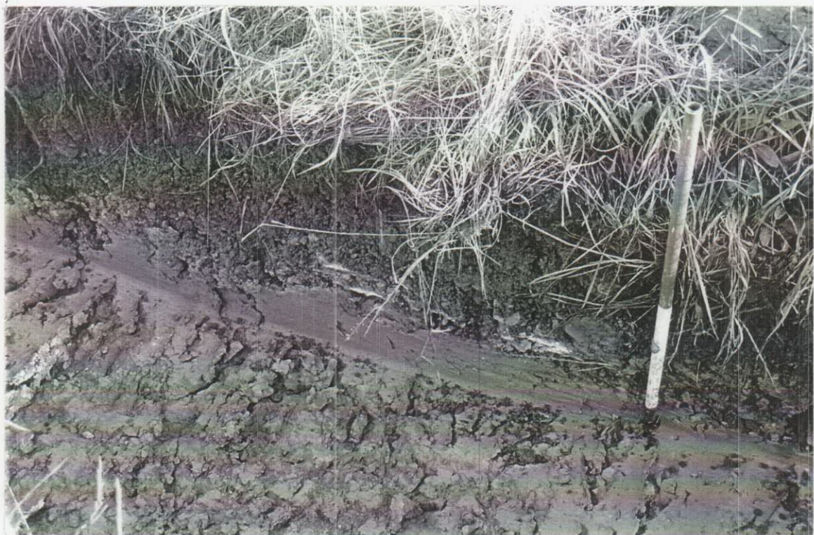
Plate 2 Trench 9 - Section through fragmented limestone, viewed from the west