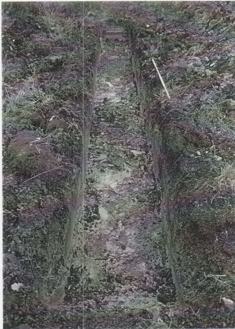
Plate 1 Trench 4 - viewed from the east